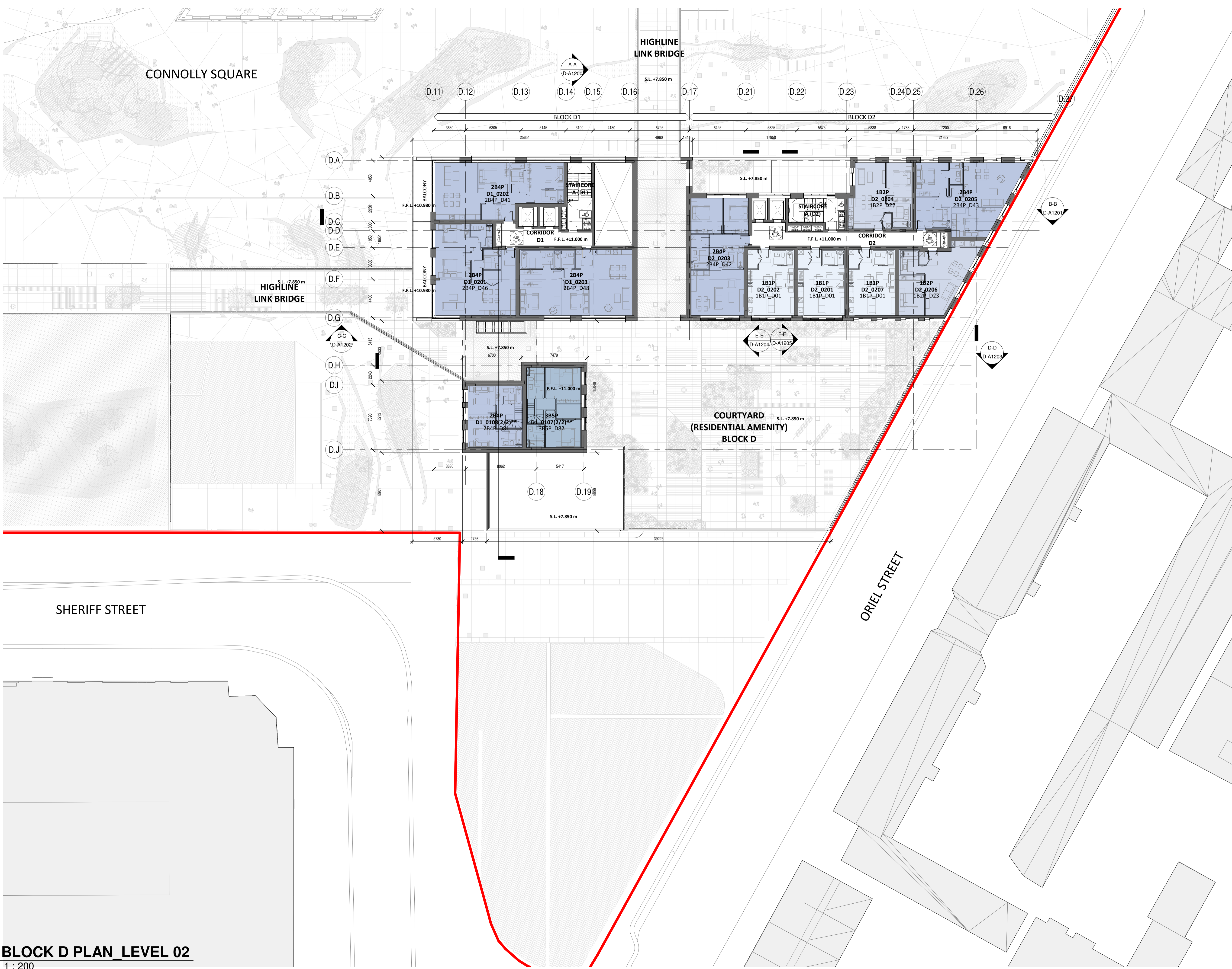
1 BLOCK D PLAN_LEVEL 02 1 : 200